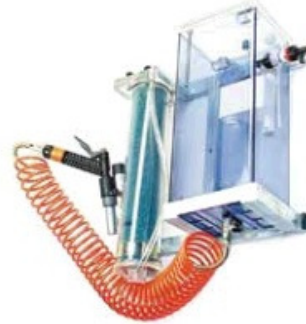
Face 1: General drawing of the system of Vinky balance