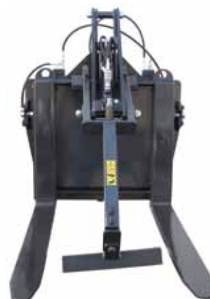
RLC.A - 180° bin rotator