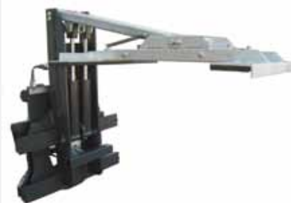
RLC - 360° bin rotator