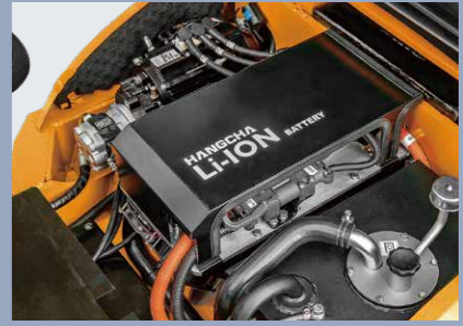
Double permanent magnet synchronous motor system