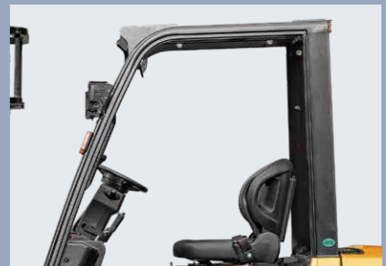
Ergonomically designed forklift enables a wide view