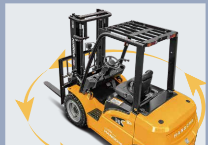
Turning radius reduced