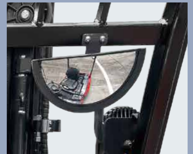
Panoramic rearview mirror