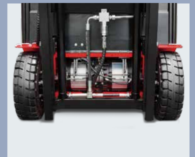
Front dual separated motors