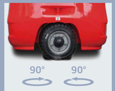
The small turning radius is suitable for narrow channel