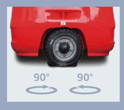
he small turning radius is suitable for arrow channel