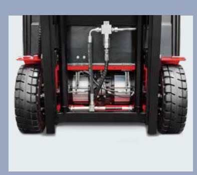
Front dual senarated motors