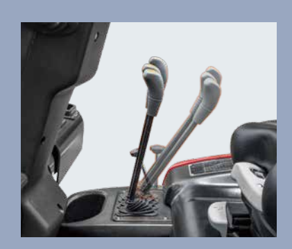
Cover can be easily opened by adjusting the levels forward