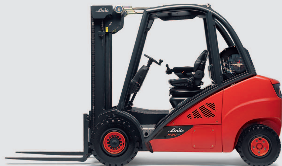
Picture top: Beverage application Picture middle: Beverage version Picture bottom: CNG version