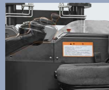
The steering wheel is extensible, so the operator can choose the best driving position