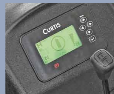
Instrument can display the steering angle and direction Synchronously