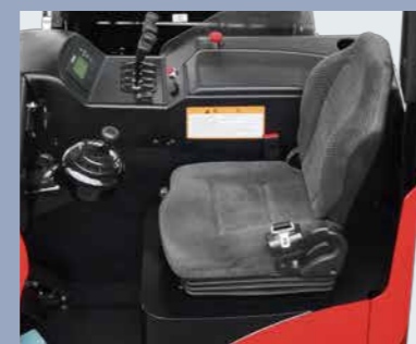
Comfortable and convenient seat

/ The driving system that is located at rear part of chassis uses EPS (Electric Power Steering) technology, features low-speed and large torque. The 180-degree steering mode of standard configuration, make the truck flexible and convenient, and allow it turn easily even in confined space.